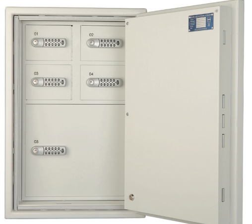
Electronic Inner Coffers