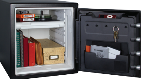
1 Hour Digital Fire Safe XX Large