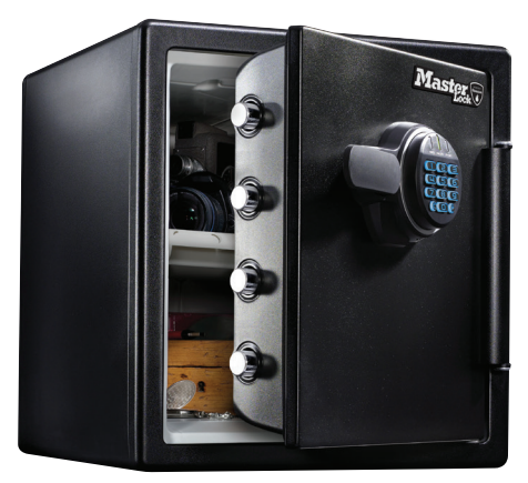
1 Hour Digital Fire Safe X Large

The perfect solution for storing important documents and valuables, the Master Lock<sup>®</sup> fireproof safes are UL classified and offer 60 minute protection at 927°C or 120 minute protection at 1010°C. All models are ETL verified, water resistant for 24 hours to a depth of 200mm, and are able to be locked via a programmable digital keypad.