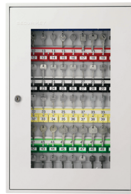
System 50 Key View (page 9)