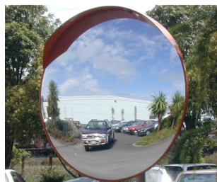
Exterior Deluxe HD