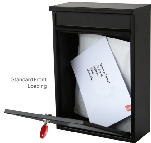
Standard Front Loading