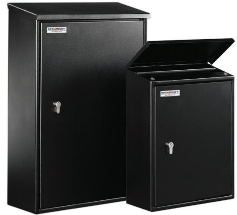
High Security Range