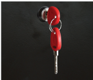
High Quality Cam Lock