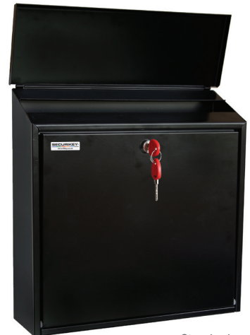
Standard Top Loading