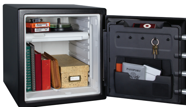
1 Hour Digital Fire Safe XX Large

Download the Master Lock® brochure from securikey.co.uk for further details.