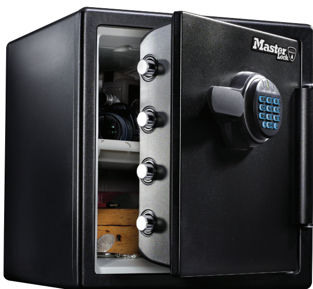
1 Hour Digital Fire Safe X Large